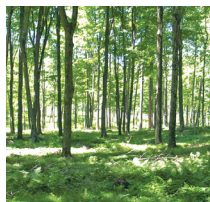
A heavily deer-browsed woods lacking a new generation of small trees.

The occurrence of moderate to severe deer browse creates substantial challenges for tree regeneration and recruitment.