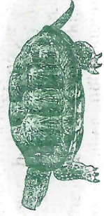
Wood Turtle - Threatened

Management plans for many forests identify areas where salvage logging may not be appropriate.